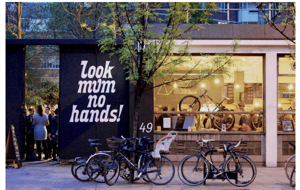
A community cafe and cycle hub could be part of the new facility