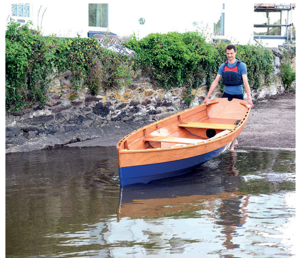
Watersports could form a core part of the offer and create engagement with the River